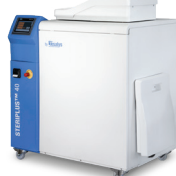
STERIPLUS™ 40 4/10 kg/h