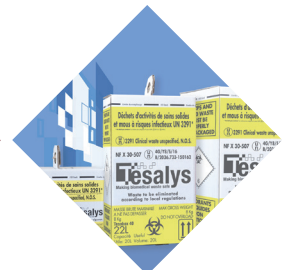
TESABOX Cardboard containers for biohazardous waste