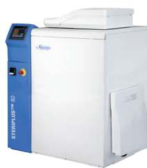
STERIPLUS™ 80 8/20 kg/h