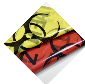
TESABAG Autoclavable biohazardous waste bags