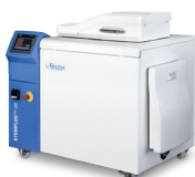
STERIPLUS™ 20 2/5 kg/h