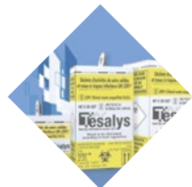
TESABOX Cardboard containers for biohazardous waste