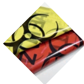
TESABAG Autoclavable biohazardous waste bags