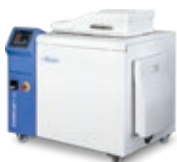
STERIPLUS™ 20 2/5 kg/h