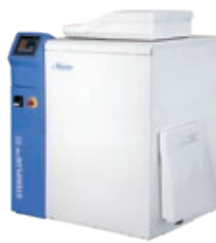
STERIPLUS™ 80 8/20 kg/h