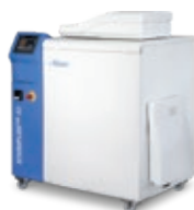
STERIPLUS™ 40 4/10 kg/h